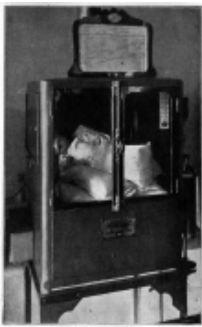
THE BIRD OF THE INCUBATOR.